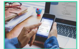
Smartphone (IOS / Android)