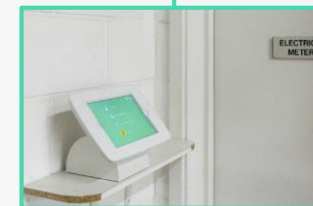
Kiosk mode (beta)