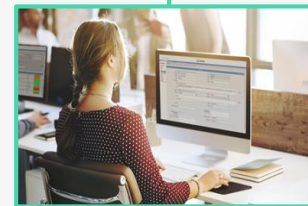
Modern web browser (Chrome, Edge etc)