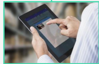
Tablet (IOS / Android)